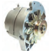
1" Single Mount