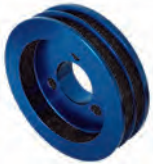
Dual V PTO