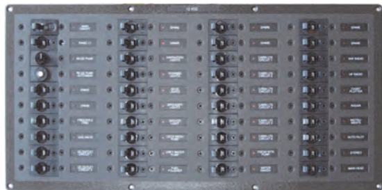
AC & DC Electrical Panels