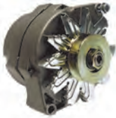
2" Single Mount