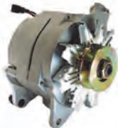
3" Dual Mount