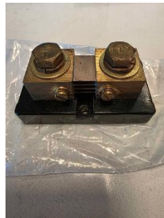
Deltec 500 amp DC Battery Shunt. Used with battery monitors such as Xantrex Link and others.$65