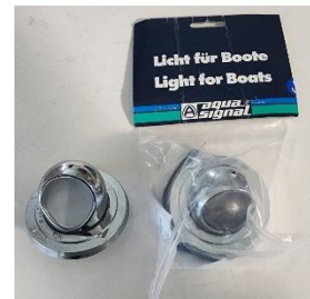
Aqua Signal Mini- Downlight 3109140000) $65