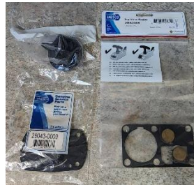
Jabsco Manual Toilet Rebuild Kits $55