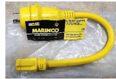
30 AMP SHORE POWER ADAPTOR / PIG TALE / MARINCO 105A $45