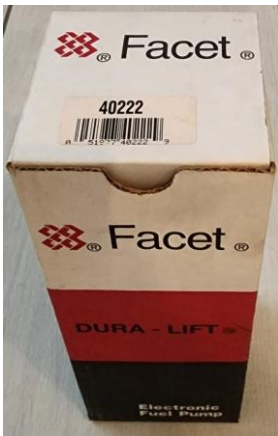
40222 Facet Dura-Lift Fuel Pump, 12 Volt, 9.0- 11.5 PSI, 33 GPH New, Never Used $125