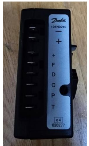
Danfoss 101N0210 Controller for BD35 or BD50 $125