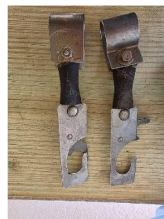
Schaefer Anchor Hanger for Danforth Style Anchors $35