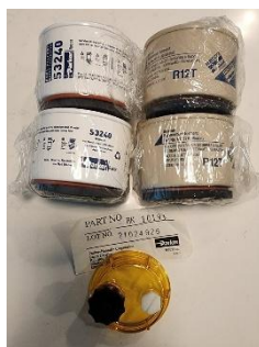
Parker Racor Fuel Water Separator Filters, 10 Micron (S3240 & R12T) and Replacement Bowl (RK10193) $15