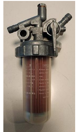
Kubota Fuel Filter Assembly 1G313-43010 (Replaces 15393-43017 & 15372-43010) $45