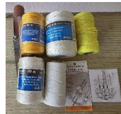
Lehigh Line, Sewing Tool, Rope Splice Tool $50