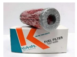
Kubota Fuel Filter Replacements - OEM 15231-43560 (4 Available) $10