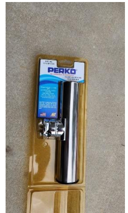
Marine Fishing Rod Holder (Perko 1215DP0CHR) for 3/4" to 1" Rails New$45