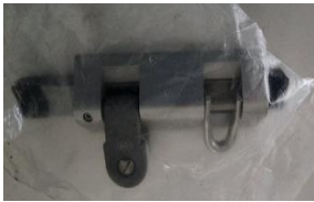
ZSPAR Boom Car Outhaul 3074 for Zspar Z480 boom $350