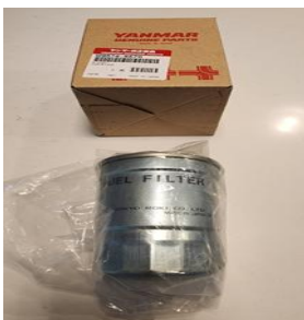
Yanmar Fuel Filter, OEM 129574-55711 (5 available) $60