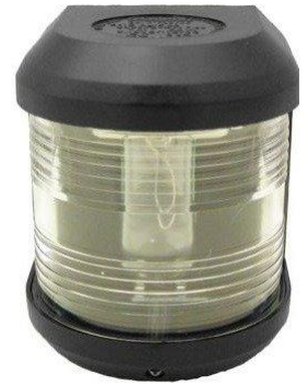
AQUA SIGNAL 41500 SERIES 41 NAV LIGHT FOR POWER OR SAIL DIRECT MOUNTING, STERN SIDE MOUNT, BLACK $110