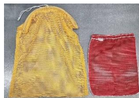
2 Dive Collection Mesh Bags - 24W x 29L, 15W x 19L $23