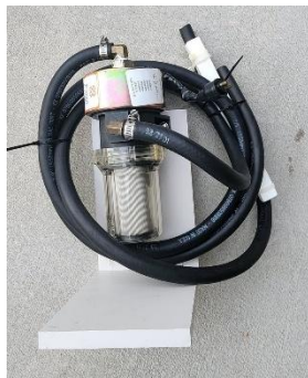
40222 Facet Dura-Lift Fuel Pump, 12 Volt, 9.0- 11.5 PSI, 33 GPH with Wiring & Hose $140