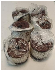
Parker Racor Fuel Filter Element, 02 Microns, 2010SM-OR (6 Available) $15