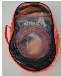
silver/silver-chloride (Ag/AgCl) reference electrode $104