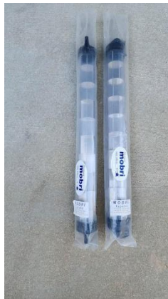
Marine Radar Reflector (Mobri Type S-2 Small Black) for Off-Shore Boating. New never used orig $150, $74