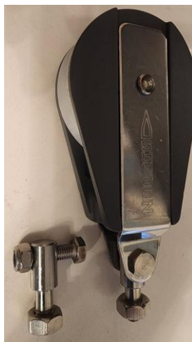
ZSPAR 302 80mm Block Double Swivel Base 10mm $90