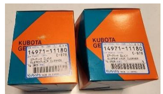
Kubota Air Filter Cleaner - OEM 14971-11180 (2 available) $35