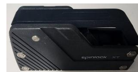
Spinlock XT $175