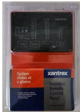
Xantrex 84-2056-01 Freedom Remote Control Panel $129