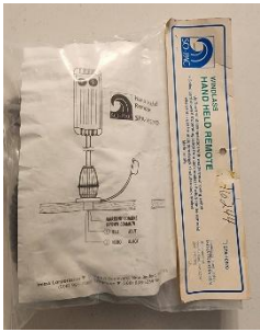
Horizon Windlass (Up/Down) Hand Held Remote Control - New kept as Spare, never used.$135