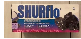
SHURflo Marine/RV Water Pump 2088-414- 934 3.8Gal/min) $275