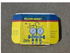
Yellow Jacket AC R12 R22 R 502 Gauge with hoses) $99