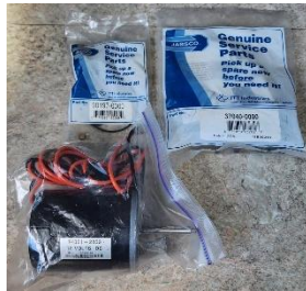
Jabsco Marine Electric Toilet Rebuild Kits $199