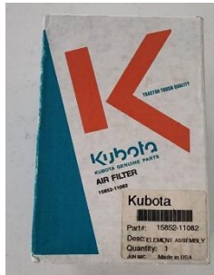
Kubota Air Filter - 15852- 11082 $35