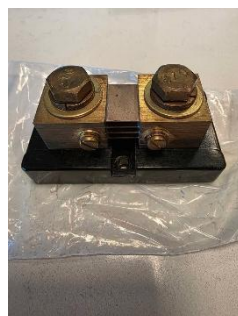
Deltec 500 amp DC Battery Shunt. Used with battery monitors such as Xantrex Link and others.$65